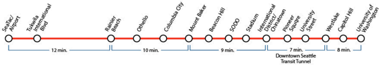
Line map - to downtown Seattle

The Virginia Merrill Bloedel Hearing Research Center (VMBHRC) is 46-minute ride from SeaTac Airport using the Link Light Rail system (Adult cash fare: $3.25).